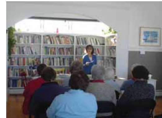
Heart Healthy Event, February 2009.

Coffee and Conversation: Wednesdays: 9:30 to 10:30 a.m.