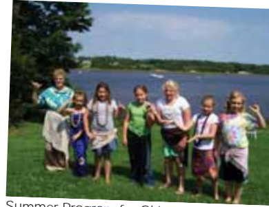
Summer Program for Girls, 2009.

If you wish, you may allocate a portion of your dues to one or more of our special library program funds. This is a wonderful way to remember a loved one. A FAN membership makes a wonderful gift, especially for out-of-town folks because it will keep them abreast of WHRL activities. Dues and donations are tax deductible to the extent provided by law.